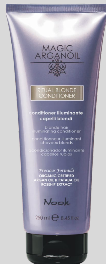
RITUAL BLONDE CONDITIONER illuminating blonde hair 10 ml / 250 ml / 1000 ml