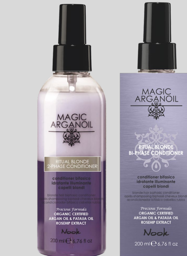
RITUAL BLONDE 2-PHASE CONDITIONER illuminating moisturizing blond hair 200 ml