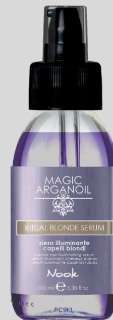
RITUAL BLONDE SERUM illuminating blonde hair 10 ml / 100 ml