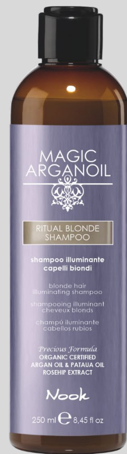
RITUAL BLONDE SHAMPOO illuminating blonde hair 10 ml / 250 ml / 1000 ml