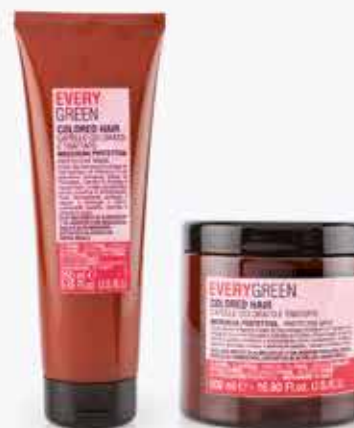
250ml tube 500ml jar

HOW TO USE: apply to wet hair and massage. Leave for 3-5 minutes. Rinse thoroughly.