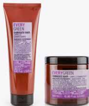
250ml tube 500ml jar

HOW TO USE: apply to wet hair and massage. Leave for 3-5 minutes. Rinse thoroughly.