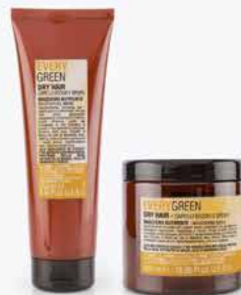
250ml tube 500ml jar

HOW TO USE: apply to wet hair and massage. Leave for 3-5 minutes. Rinse thoroughly.