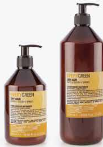
Pump bottle 500ml - 1000ml

HOW TO USE: apply to wet hair and massage, ensuring that the product is distributed evenly, including the roots. Rinse thoroughly, until no trace of the product remains.