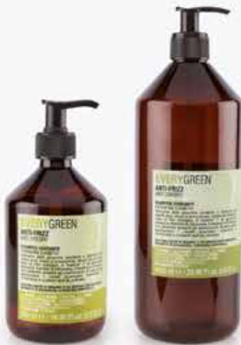
Pump bottle 500ml - 1000ml