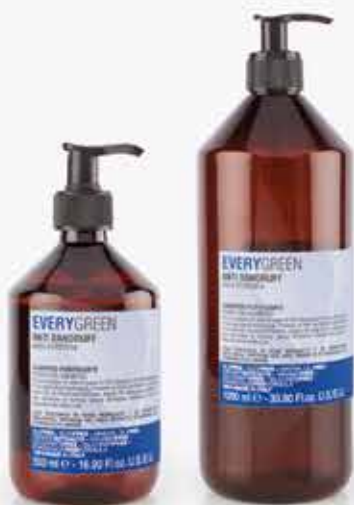
Pump bottle 500ml - 1000ml