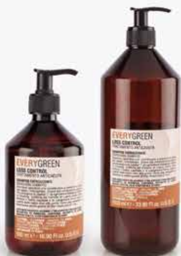
Pump bottle 500ml - 1000ml