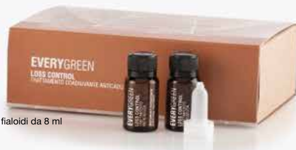
10 fialoidi da 8 ml

HOW TO USE: apply to wet hair and massage. Rinse thoroughly.