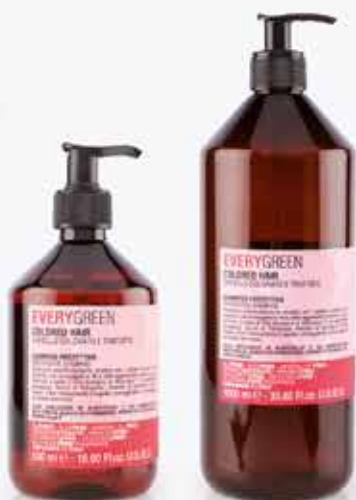
Pump bottle 500ml - 1000ml