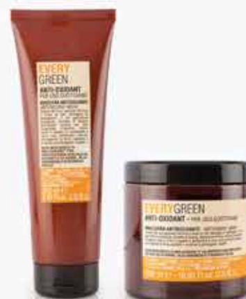
250ml tube 500ml jar