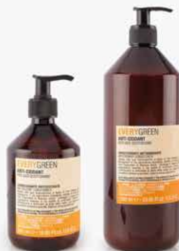
Pump bottle 500ml - 1000ml

HOW TO USE: apply to wet hair and massage. Rinse thoroughly.