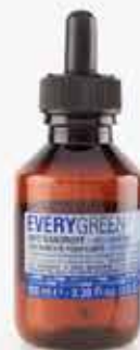
Flacone con contagocce 100ml

HOW TO USE: apply to wet hair and massage. Rinse thoroughly.