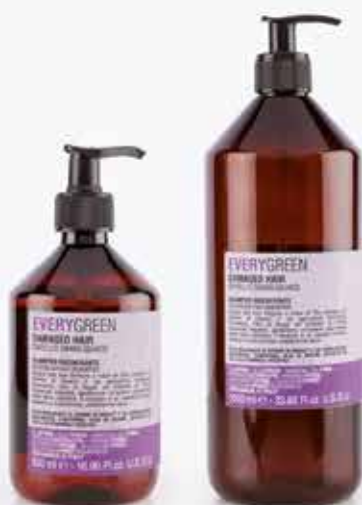
Pump bottle 500ml - 1000ml