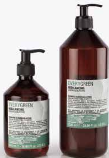
Pump bottle 500ml - 1000ml