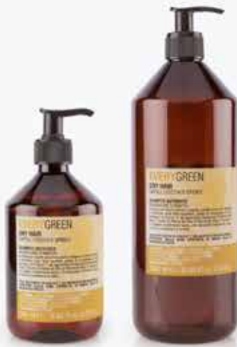
Pump bottle 500ml - 1000ml