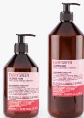
Pump bottle 500ml - 1000ml

HOW TO USE: apply to wet hair and massage. Rinse thoroughly.