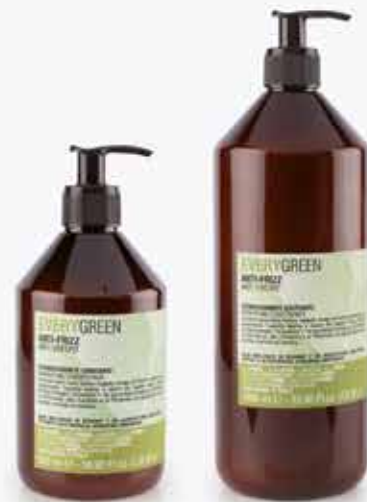
Pump bottle 500ml - 1000ml

HOW TO USE: apply to wet hair and massage. Rinse thoroughly.