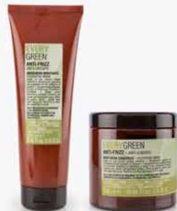
250ml tube 500ml jar

HOW TO USE: apply to wet hair and massage. Leave for 3-5 minutes. Rinse thoroughly.