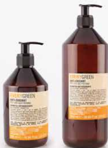
Pump bottle 500ml - 1000ml