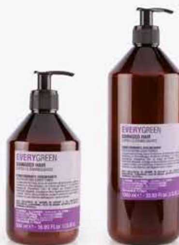
Pump bottle 500ml - 1000ml

HOW TO USE: apply to wet hair and massage. Rinse thoroughly.