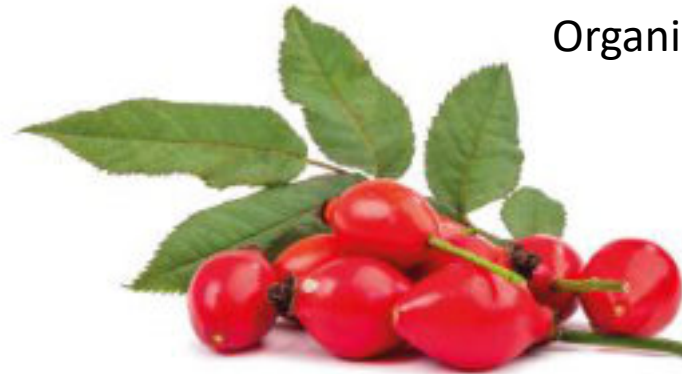
Organic ROSEHIP oil

Basically: it makes hair HEALTHIER and IMPROVES ITS APPEARANCE .