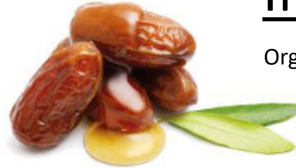
Organic JOJOBA oil

Thanks to its film-forming properties, it leaves the hair SOFT and Voluminous . IT also HELPS STRENGTHEN HAIR . Protects and moisturizes hair fibers.